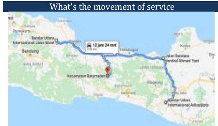
Figure 2 Movement of Airports Nearby