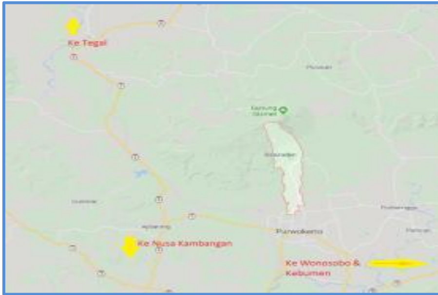
Figure 1 Network Roads in Area Tourism Baturraden

Administratively Baturraden tourist resort located in Banyumas, Central Java, Indonesia. In the coordinates Baturraden tourist area located at 7 ° 18'46.7 "south latitude and 109 ° 13'43.3" east longitude at an altitude of 918 meters above sea level. Baturraden tourist area located in the sub-district administrative area Baturraden.