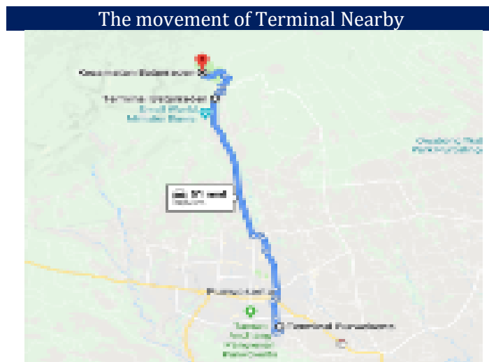
Figure 4. Movement of Terminal