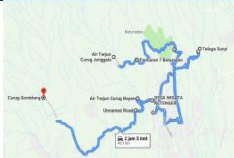
Figure 5. The movement of travelers between the attraction