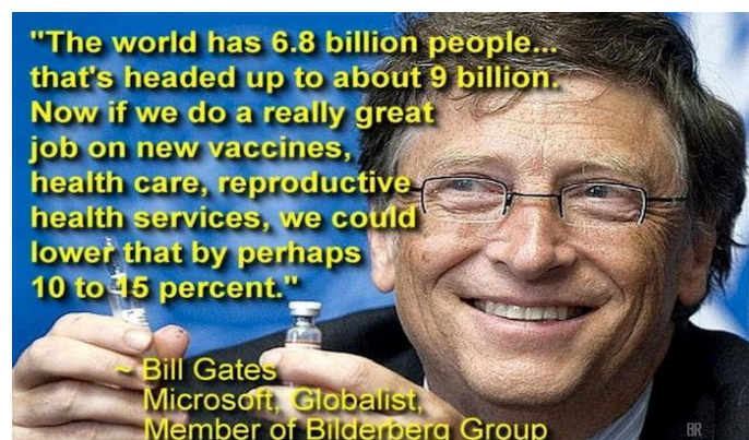
Fig. 2- The hegemonic vision of Microsoft tycoon Bill Gates

It was the re-edition of a previous event organized by Bill Gates in 2019 [1] that also anticipated the outbreak of a viral pandemic. And it's not the first time. According to Robert F. Kennedy Jr., who filed a documented indictment against Bill Gates and his vaccination obsession and his thirst for "dictatorial control over global health policy" Fig. 2, is part of a strategy aimed at global domination over humanity [6].