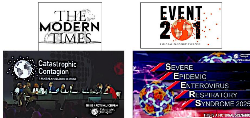
Fig. 1- From Newspaper The Modern Times

“current and former Health Ministers and Senior Public Health Officials from Senegal, Rwanda, Nigeria, Angola, Liberia, Singapore, India, Germany, as well as, Bill Gates attended the exercise..”